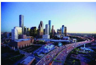
Houston, TX, USA