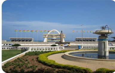
FCT Abuja, Nigeria